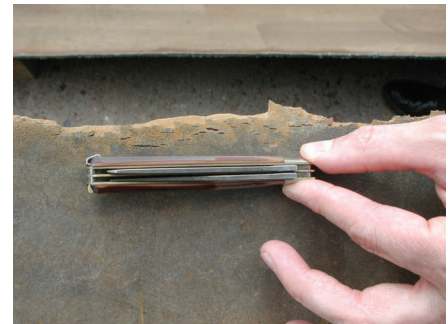
Cause of Failure — Stress-corrosion cracking.