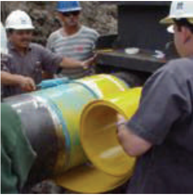
Pipeline repair methods.