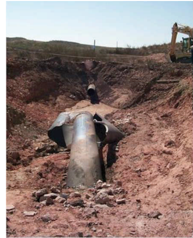
Natural gas pipeline failure.

ORNL SMEs evaluate pipeline incidents such as leaks and failures.