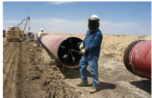
New pipeline construction.

ORNL SMEs inspect new pipeline construction, verify repair methods, and review pipeline inspection data.